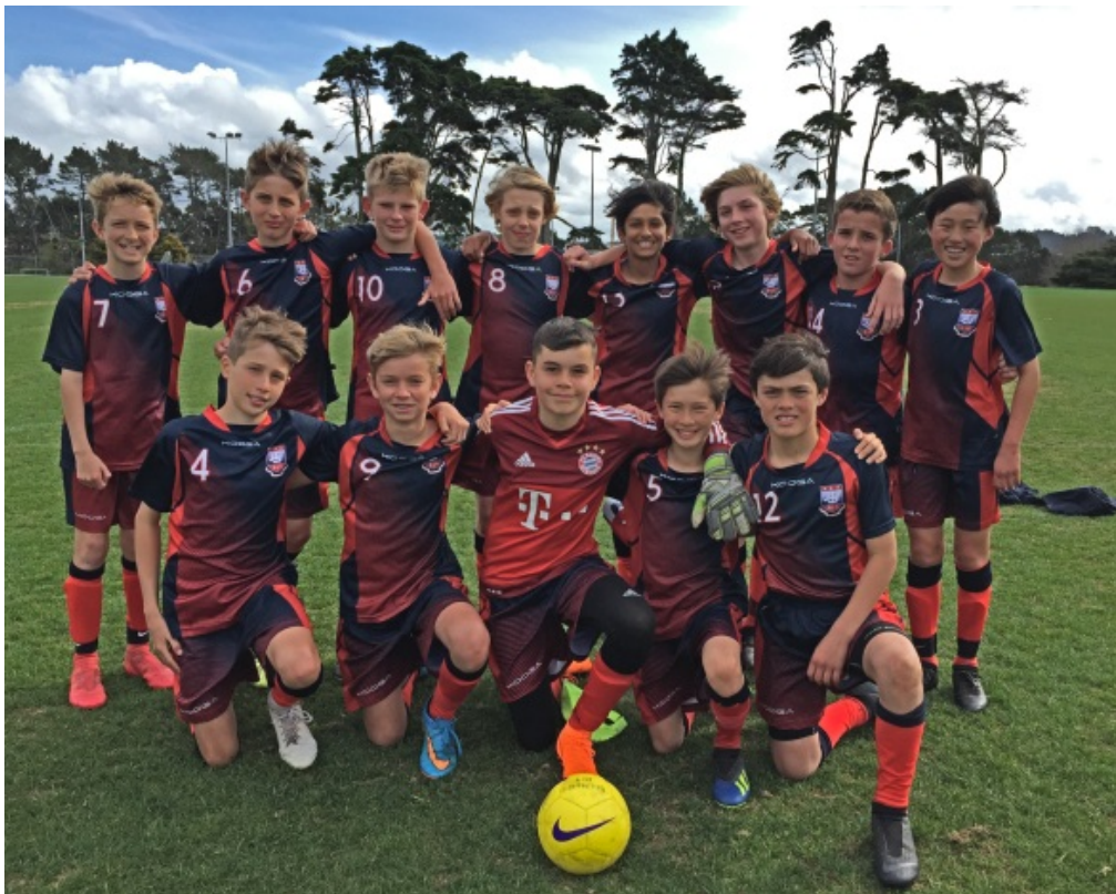
Pictured above: Our boys soccer team