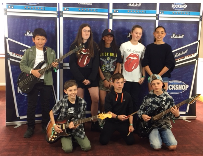
Pictured above: Purely Electric