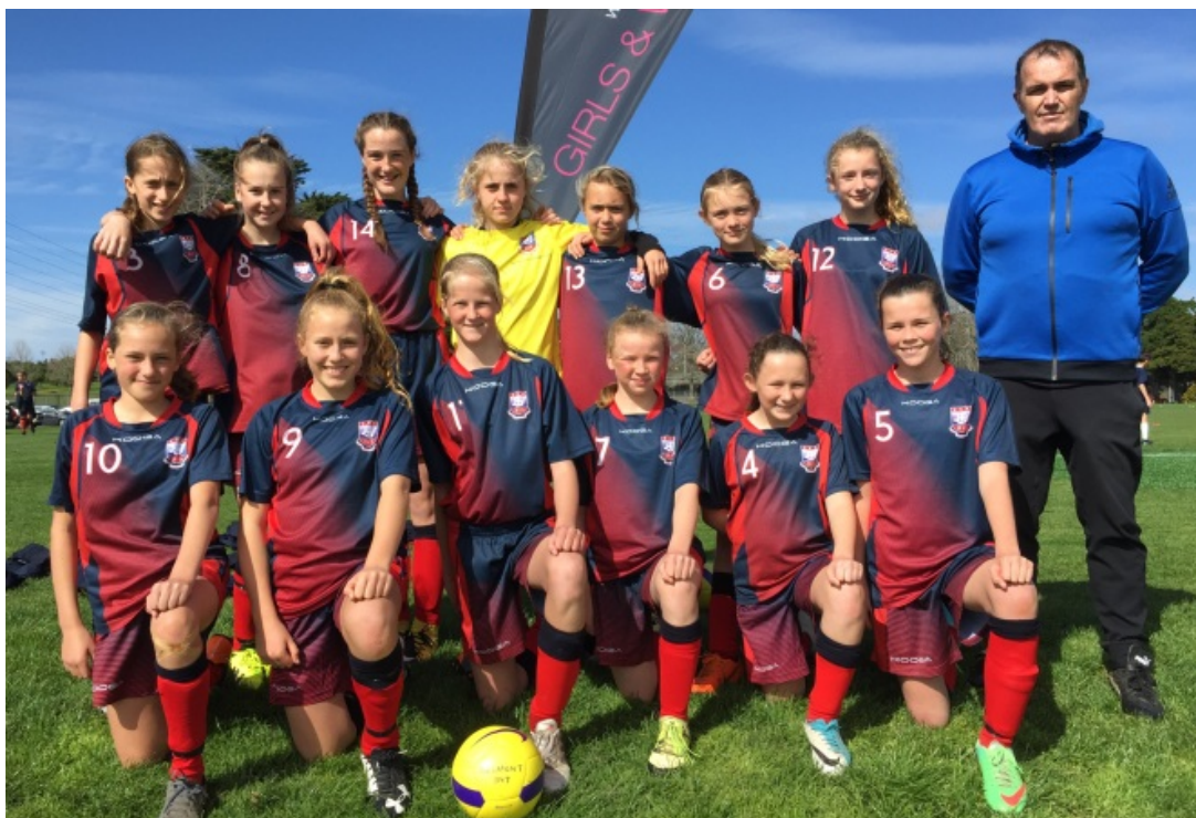
Pictured above: Our girls soccer team