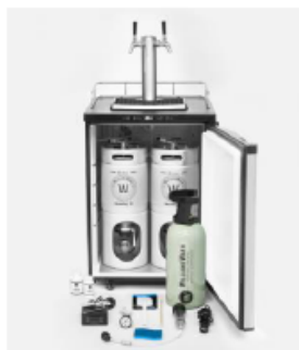
BrewKeg10 Complete Pack PLUS