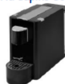
Valued at $94