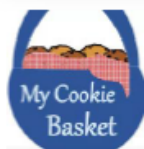
My Cookie Basket - 5 boxes of various slices and cookies Valued at $82