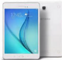
Samsung Galaxy Tab A6 Tablet Valued at $250

Get in there and bid; give our kids a fantastic media room!